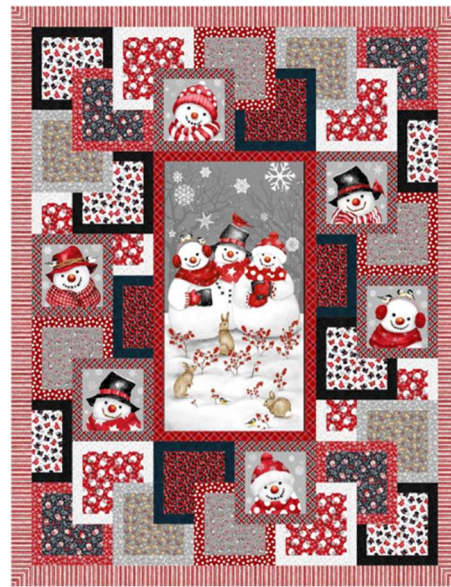
Snowmen, 66" x 78"