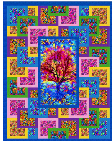
Tree of Life, 66" x 78"

Kits for the Panel Play Class, which includes panel, fabric and book, are $80. If you wish to use your own panel and fabric, you MUST order the book by September 1 st .