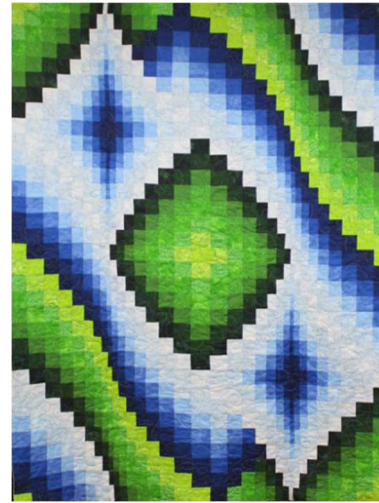
"Reflection" 50" x 70", $70