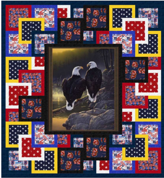
Eagles, 72" x 78"