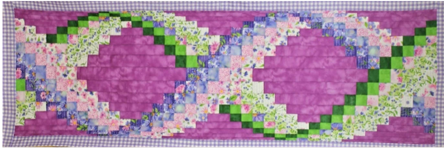
"Garland" 28" x 61", $60