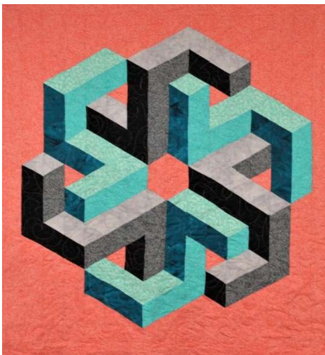
"Whiligig" 42" x 45", $40