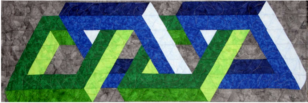
"Turnstiles" 22" x 60", $30