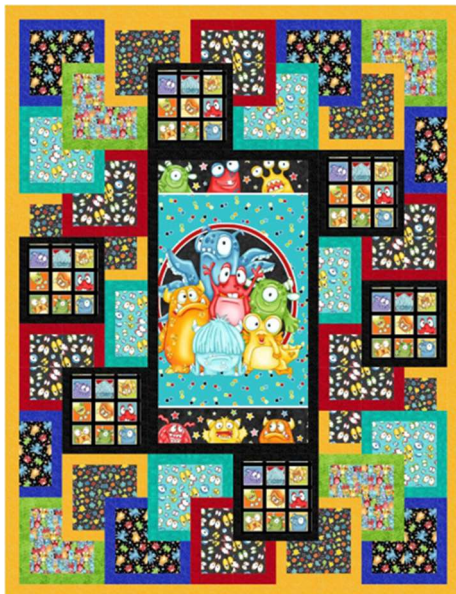
Monsters, 66" x 78"